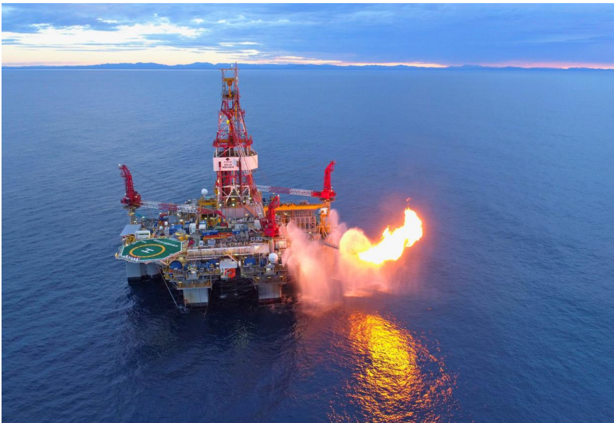
Diamond Offshore Ocean Monarch conducting flow back operations at Sole-3 on 5 July 2018

Cooper Energy (ASX: COE) announces that Sole-3, the first of two production wells for the Sole Gas Project, is being shut-in for future connection after successful performance of clean-up and flow back operations. A summary of information relating to the requirements of ASX Listing Rule 5.30 is provided in Table 1 below.